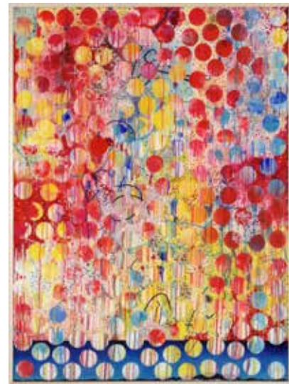
Floodtide, 2010, 133x100cm, acrylic and resin on panel