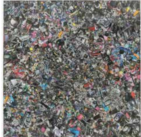
Transformer 1, 2011, 165x165cm, collage, acrylic and resin on canvas